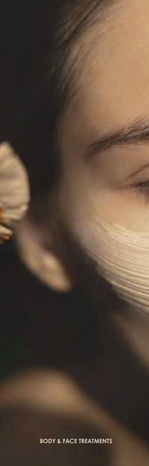
BODY & FACE TREATMENTS